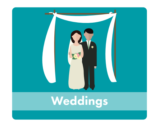
Public religious ceremonies, such as weddings