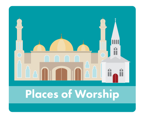
Places of worship or buildings rented for religious services