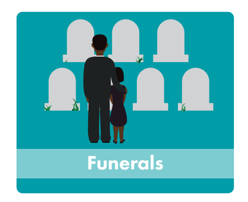
Public religious ceremonies, such as funerals