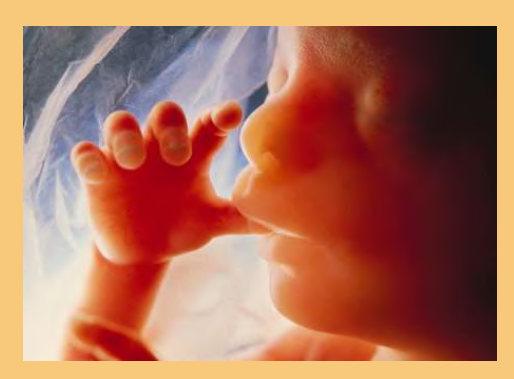
Your Baby is Alive and Growing